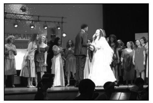
Have courage and be kind. When There is kindness, There is goodness. When There is goodness, There is magic.