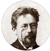
Anton Pavlovich Chekhov 1860-1904

The original Broadway production of The Good Doctor opened in 1973 and enjoyed a lengthy run. It was nominated for five Tony Awards, ultimately winning the award for Featured Actress in a Play.