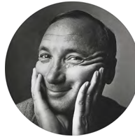
Neil Simon 1927-